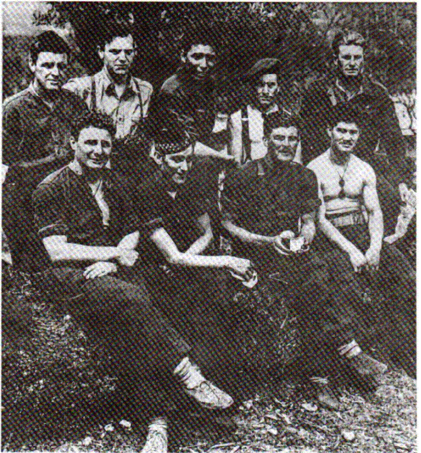
The Cape Breton Highlanders baseball team of May 1944, at an Italian rest camp. Within days, these men would be going into action against the Hitler Line south of Rome, one of the Canadians' great victories in Italy.